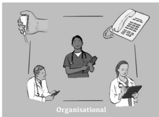
Allen, D. (2015). Inside 'bed management': ethnographic insights from the vantage point of UK hospital nurses. Sociology of Health & Illness , 37(3), 370-384.